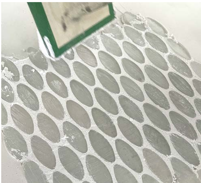
8 Spread grouting