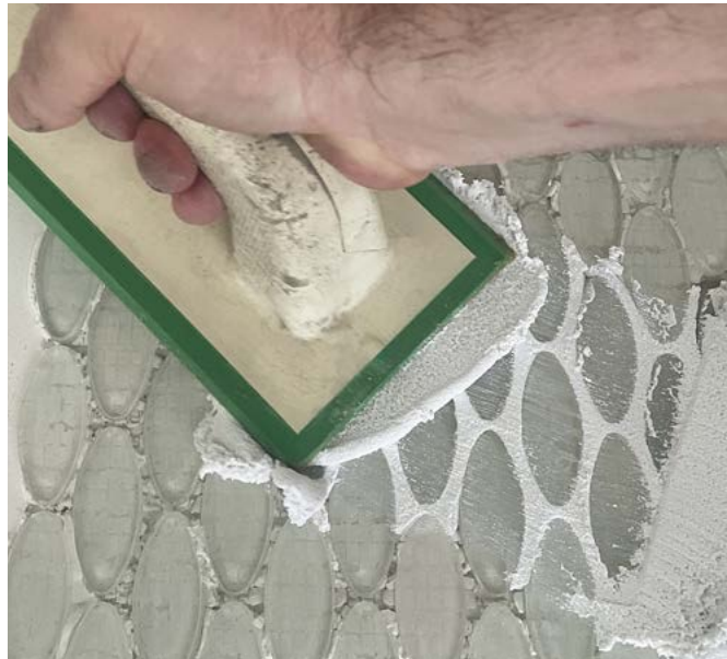
6 Start grouting