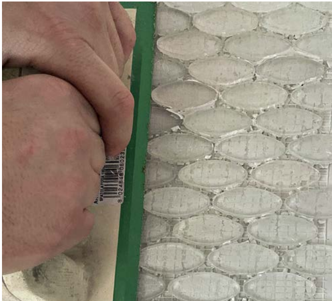
5 Pressing the glass mosaic by trowel