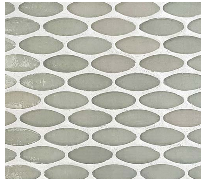
10 Final correct look with no visible empty holes and no visible fiber mesh