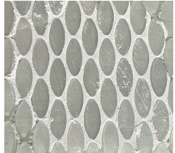
7 With correct grouting the empty holes and white fiber mesh are not visible